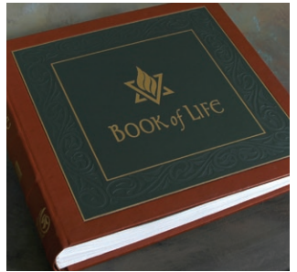
Donors may sign the Book of Life upon promising a legacy gift of any size to the Jewish community.