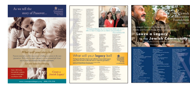
Look for us in the San Diego Jewish Journal and other publications.

SEE ALL OF THE BOOK OF LIFE ENTRIES AT www.jcfsandiego.org/bookoflife