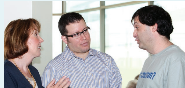
Our donor education series features current trends and prominent speakers.